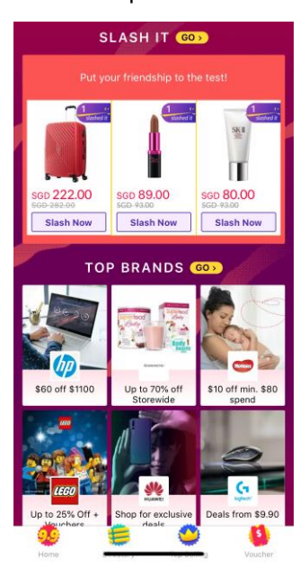
Over 215,000 blockbuster deals and discounts up for grabs on 9.9

Come 9 September 2018, consumers can expect: